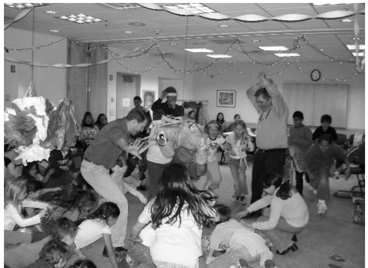
Children scramble to get the goodies from a piñata at the holiday Posada party, an annual favorite for children and families served by Tennyson Center's Community-Based Services program.