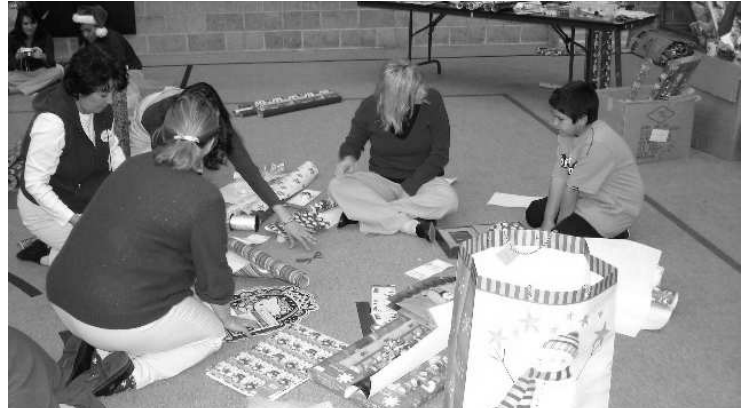
Target employees help with the wrapping of gifts during the annual "Santa Shop", where Tennyson Center children get to pick out gifts for their families.

For the first time in the history of the agency, the campus of Tennyson Center took on a new look during the holiday season as lights were strung along with frosted trees, wreaths and illuminated candy-canes on the outside and grounds of the main building.